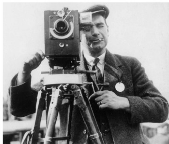
North West FILM ARCHIVE